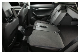
SKODA Karoq -023