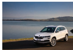
SKODA Karoq -004