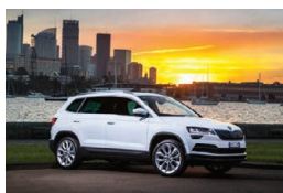
SKODA Karoq -002