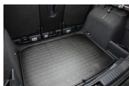
SKODA Karoq -032