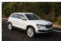
SKODA Karoq -013