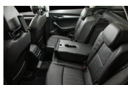
SKODA Karoq -022