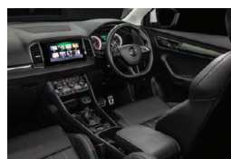
SKODA Karoq -019