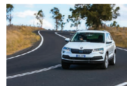
SKODA Karoq -015