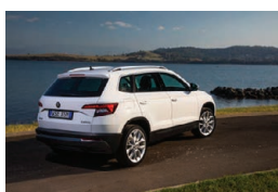
SKODA Karoq -007