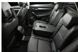
SKODA Karoq -021