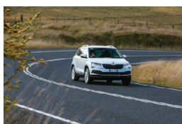
SKODA Karoq -017