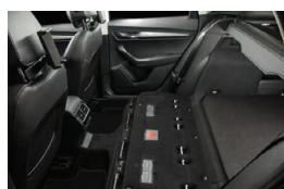
SKODA Karoq -028