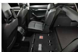
SKODA Karoq -026