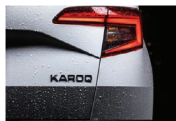
SKODA Karoq -014