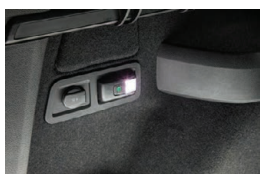
SKODA Karoq -031