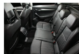
SKODA Karoq -020