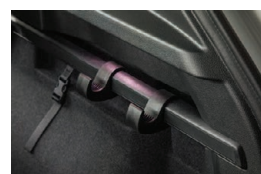
SKODA Karoq -030