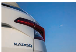
SKODA Karoq -011