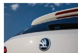
SKODA Karoq -010