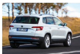
SKODA Karoq -018