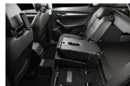
SKODA Karoq -025