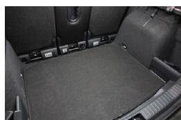
SKODA Karoq -033