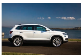
SKODA Karoq -006