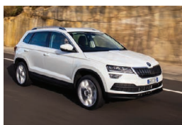
SKODA Karoq -012