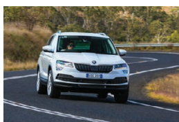
SKODA Karoq -016