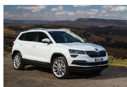
SKODA Karoq -008