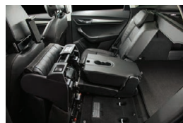
SKODA Karoq -024