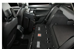
SKODA Karoq -027